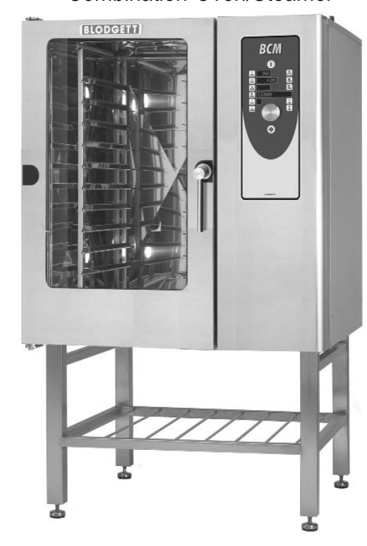
Shown on optional stand with shelf and adjustable feet

Single Electric Combination-Oven/Steamer