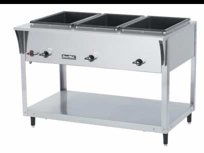
ServeWell® SL 3-Well Hot Food Table