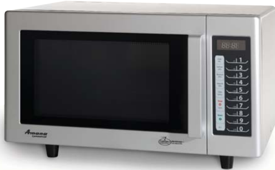
Model RMS10T and RMS10TS shown