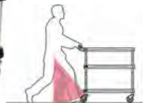
Extra leg room