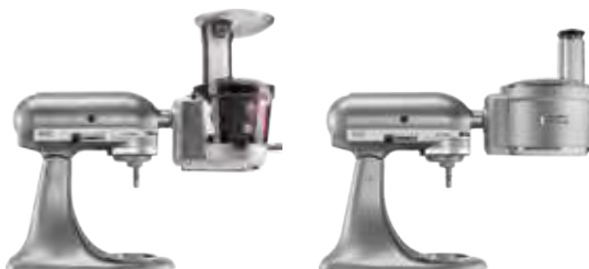
Stand Mixer Attachments