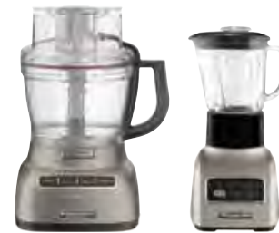
Architect® Food Processor & Blender