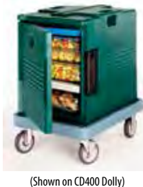
(Shown on CD400 Dolly)