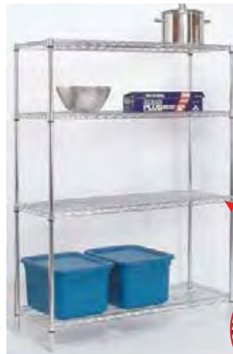
Exclusive dual connected truss for added strength